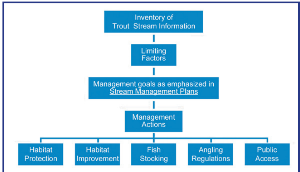
Figure 1. Hierarchical process of southeast Minnesota trout stream management.

contained in each stream file (Inventory of Trout Stream information). This is where experience and education of fisheries staff can pull necessary details out from the copious amounts of information gathered and contained in MNDNR files. The next filter requires the project to be on MNDNR public angling easements. After this the details become very diverse. Questions are asked such as: 1) will the project have a positive impact on stream process and function, 2) will the project have a positive impact on the recreational value of the reach, 3) is the project technically feasible, 4) is there potential for wild trout management, 5) will the project require a large amount of maintenance after completion, 6) what is the level of previous investment in the stream and watershed, 7) can funding be secured through various sources, 8) how well does the project fit into the current strategy of providing a range of angling opportunities within southeast Minnesota, 9) how compatible is the project with other important MNDNR resource management objectives within southeast Minnesota, 10) will there be any community interest generated by the project, 11) will the project generate any controversy and opposition, 12) how does the project fit within the context of future resource management trends within southeast Minnesota and other MNDNR disciplinary goals.